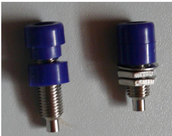
Comparison of long and short jacks

This led me to think about an alternative method for mounting the jacks so that the shorter ones, which are widely available, can also be used.