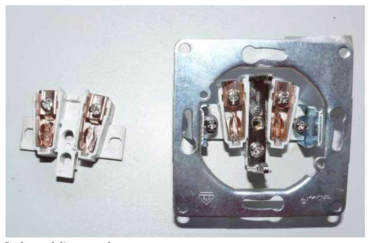
Socket and dismounted contacts

Some tube sockets are rare or expensive. So for example a 4 pole Jumbo tube socket. The tube pins have a diameter of 5 mm. This corresponds to the diameter of the contacts of a 'Schuko' plug. So just take the contacts from the cheap 'Shuko' socket (two pieces are required). For the rest see the pictures: