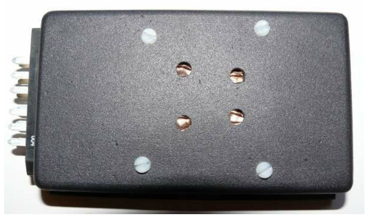
mounted into socket box