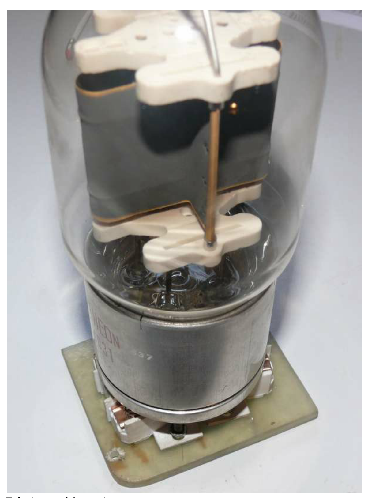
Tube inserted for testing