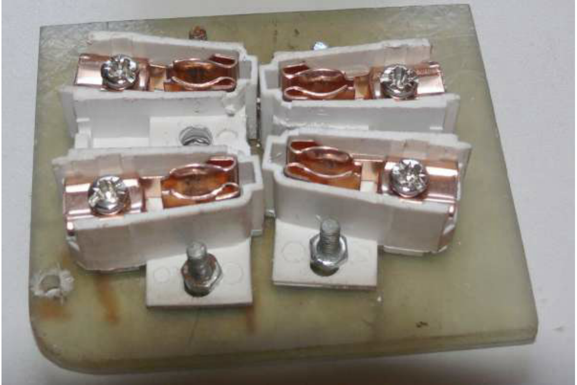
The contacts are mounted to a piece of plastic