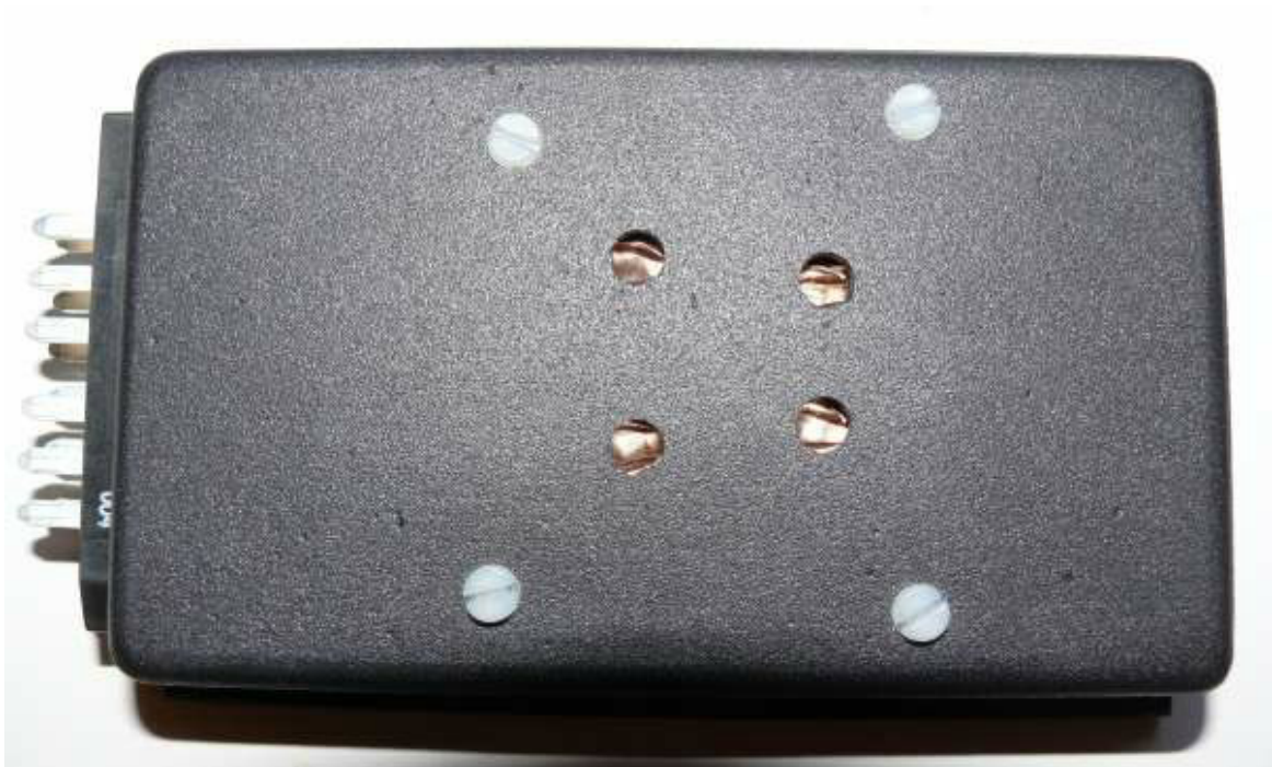
mounted into socket box