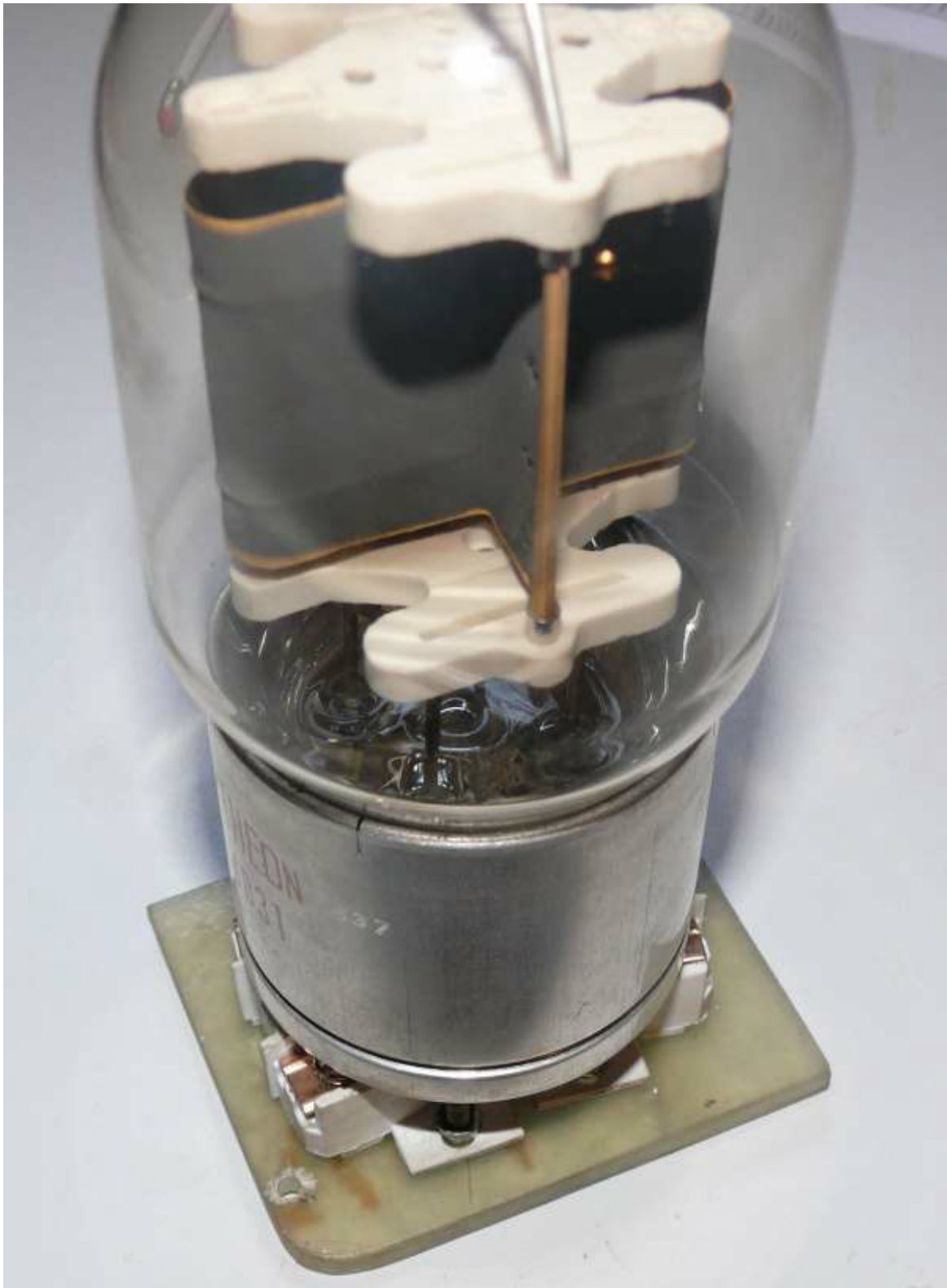
Tube inserted for testing