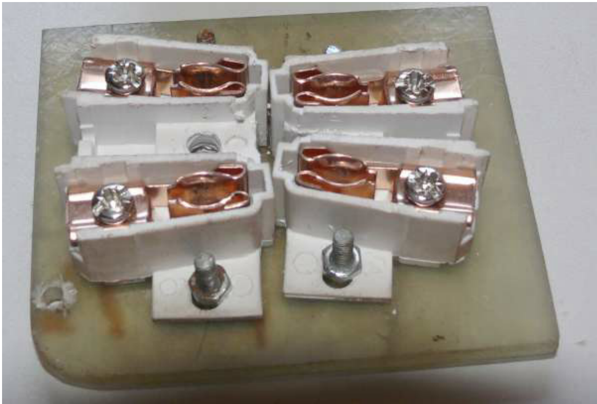
The contacts are mounted to a piece of plastic