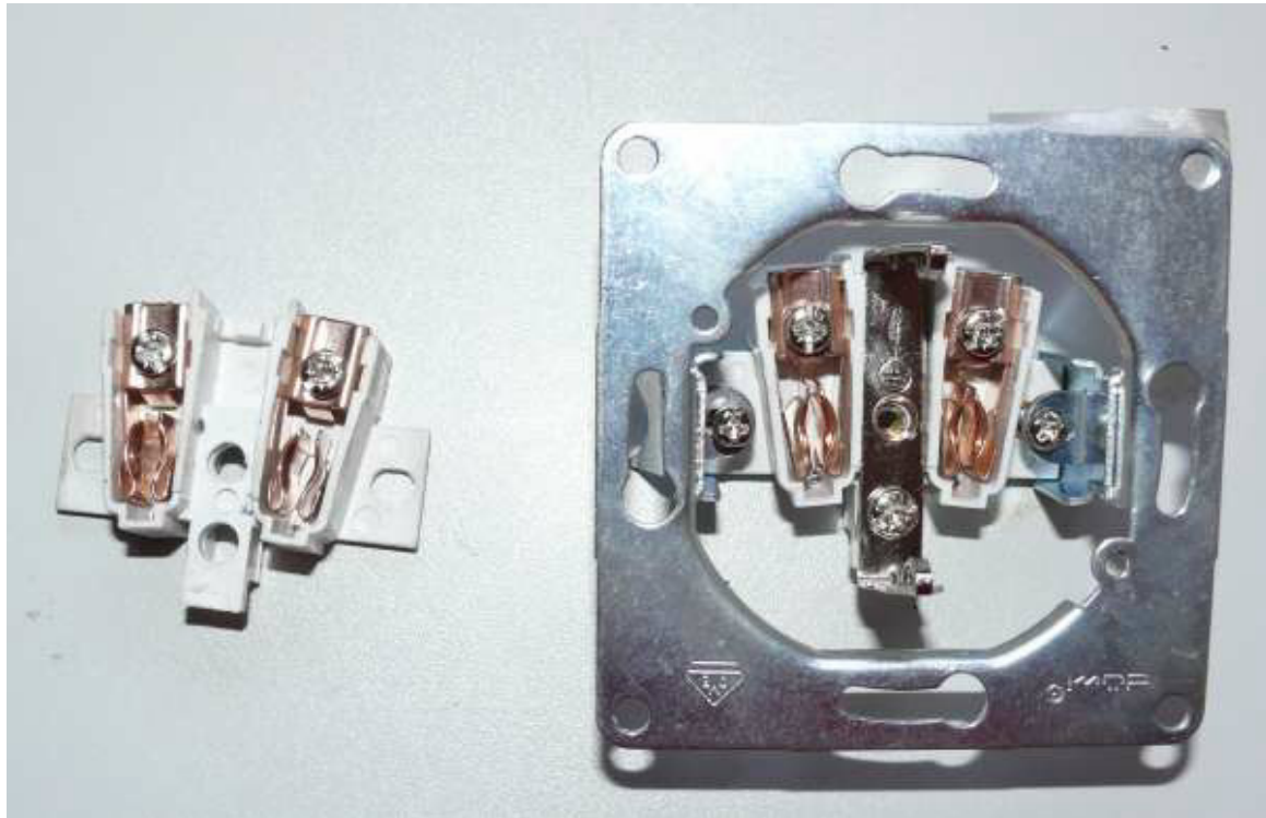
Socket and dismounted contacts

Some tube sockets are rare or expensive. So for example a 4 pole Jumbo tube socket. The tube pins have a diameter of 5 mm. This corresponds to the diameter of the contacts of a 'Schuko' plug. So just take the contacts from the cheap 'Shuko' socket (two pieces are required). For the rest see the pictures: